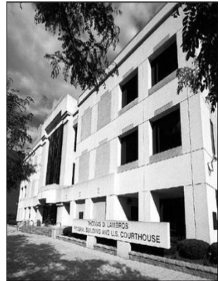
Thomas D. Lambros Federal Building and US Courthouse in Youngstown, Ohio

For tickets or more information, please contact the Ashtabula County Bar Association at (440) 415-4503.